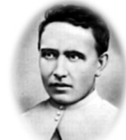
ST. DAMIEN OF MOLOKAI, SS.CC.